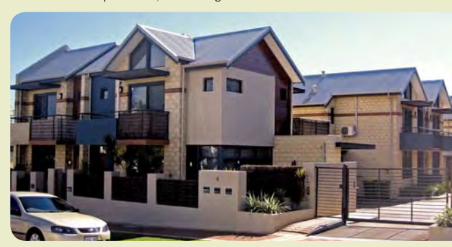
\textbf{R80} \colon \textbf{Grouped dwellings}, \ 10 \ \textbf{dwellings on a} \ 1278 \ \textbf{m}^2 \ \textbf{lot}.