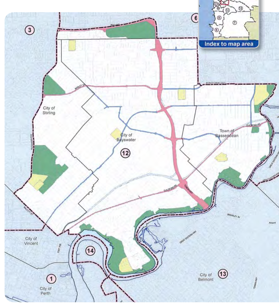
12. Amalgamated City of Bayswater and Town of Bassendean (includes parts of the Cities of Stirling and Swan).

Each Local Government now has until 4 October 2013 to prepare a submission to the Local Government Advisory Board on how the process will be achieved.