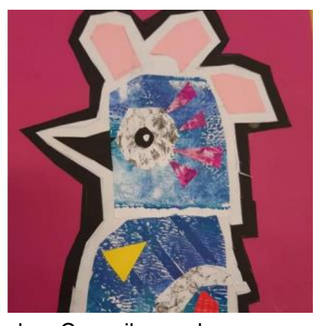
Local school students' artwork are being featured on Council agendas.

Bassendean Primary School bird designs inspired by Australian artist Pete Cromer.