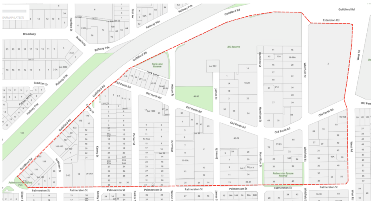
Figure. 1 - Town Centre Area 2 Map.

In late 2022, the Town undertook an audit of parking signage and restrictions of all thoroughfares located within Parking Area 2; being the area bounded by Guildford Road, West Road and Palmerston Street as detailed on the following map.