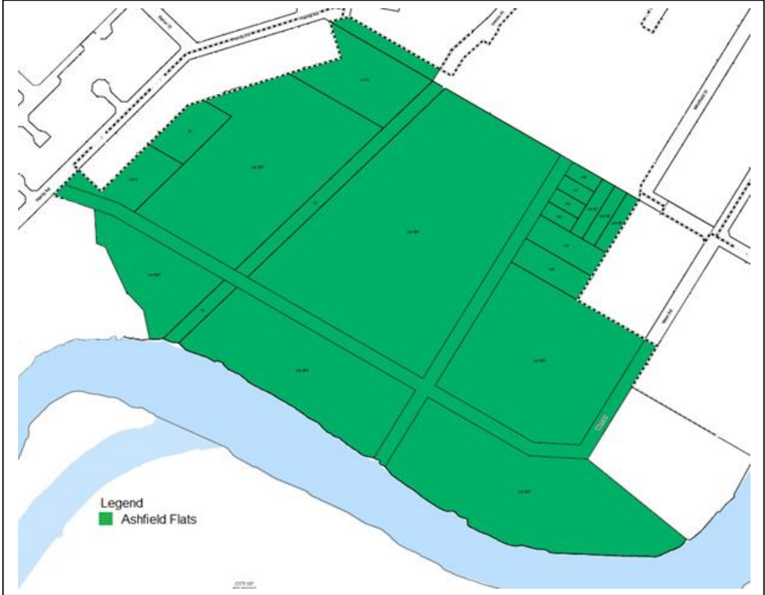
Map 5 – Ashfield Flats, cat prohibited area