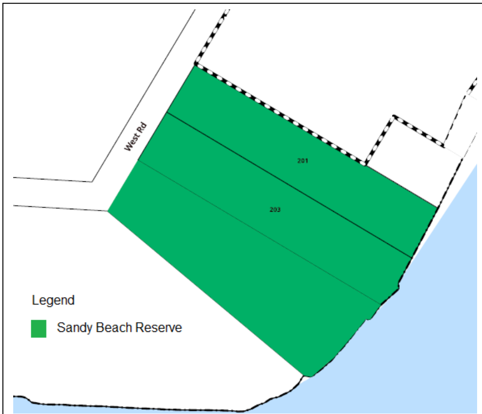
Map 3 – Sandy Beach Reserve, cat prohibited area