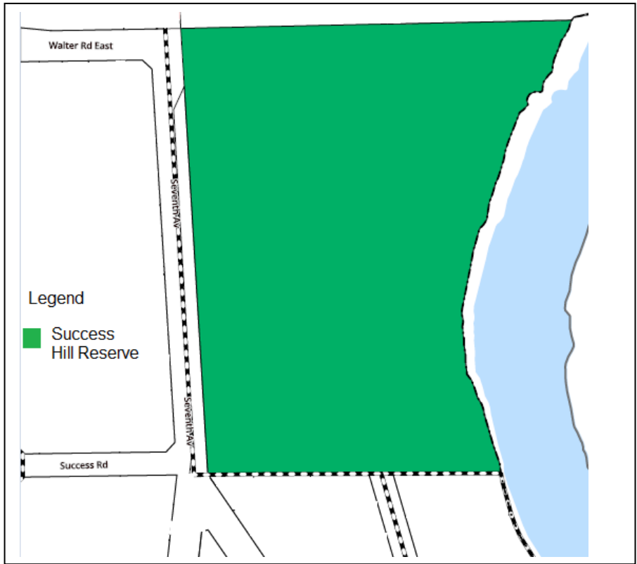
Map 4 – Success Hill Reserve, cat prohibited area