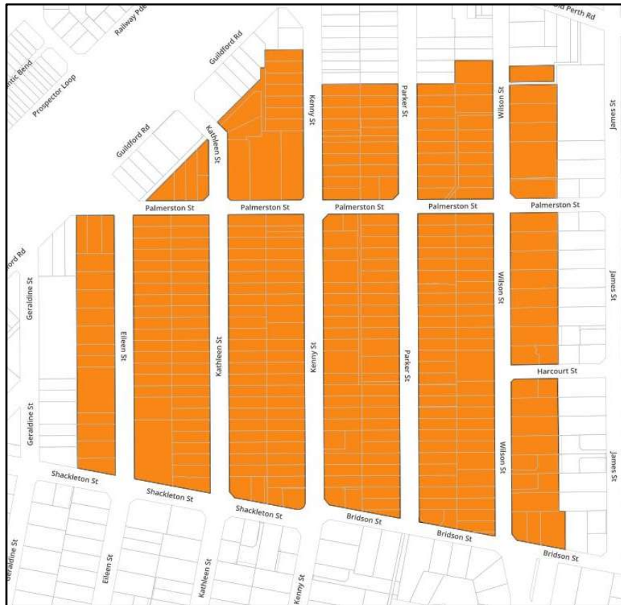
Kenny Street Heritage Area