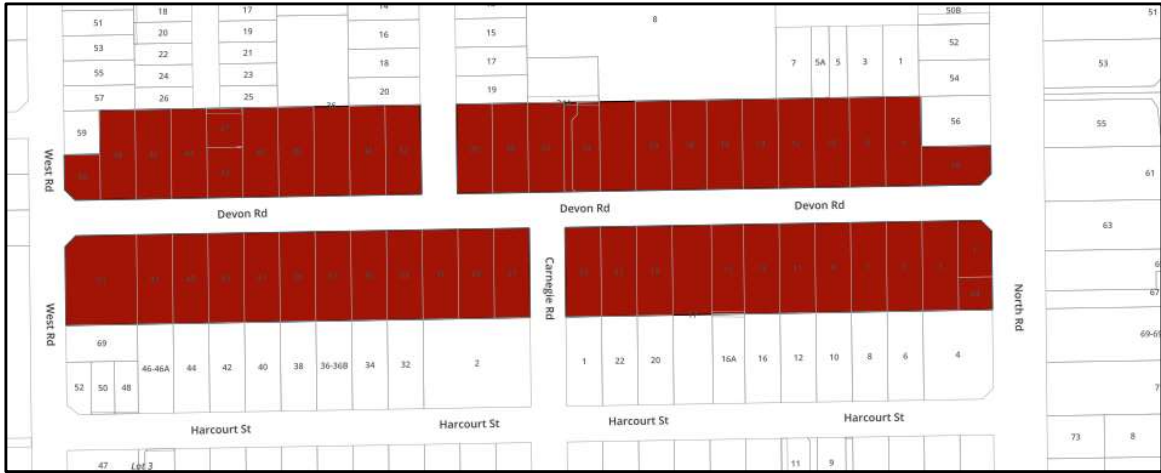
Devon Road Heritage Area