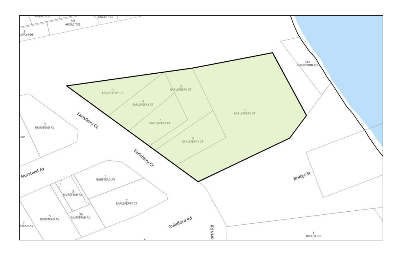
Earlsferry Heritage Area