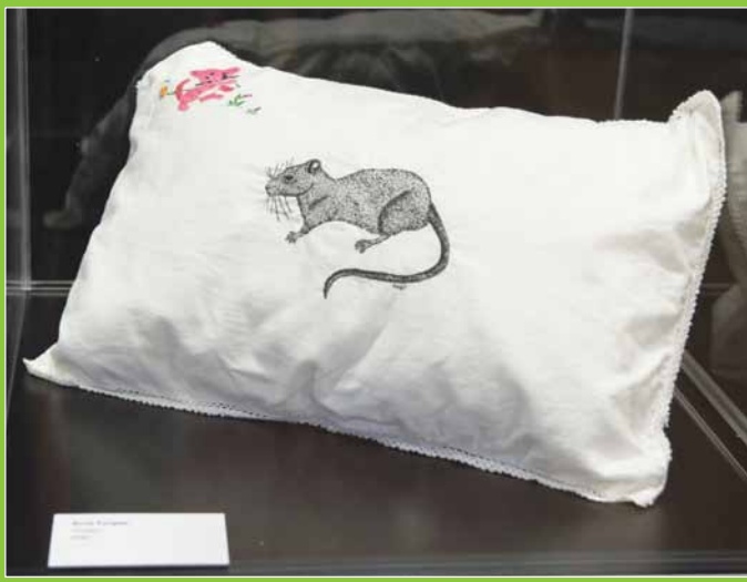
Enid Twiglet - Untitled.

Unpriced entries and late changes will not be accepted