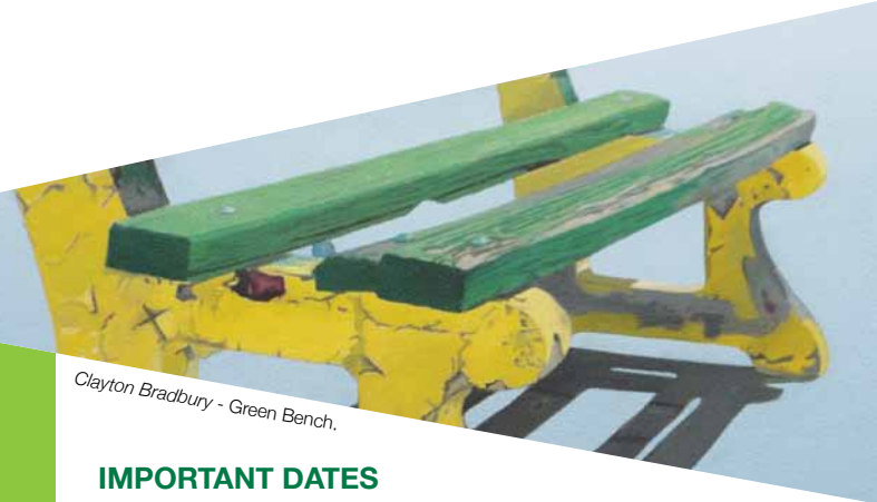
Clayton Bradbury - Green Bench.