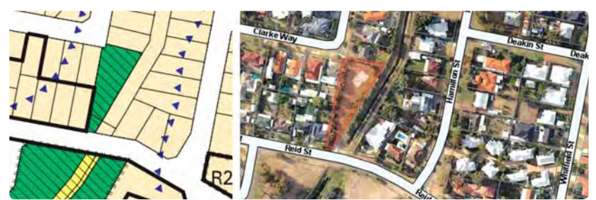
Reserve 29948: Clarke Way/Reid Street, Bassendean - Zoning map and aerial view.

AT ITS MEETING held on 28 August 2012, the Town resolved to consult the community and seek its views on the proposed closure of Crown Reserve 29948 Clarke Way/Reid Street, Bassendean. This closure will result in the relocation of play equipment and a new community facility being developed on Sandy Beach Reserve.