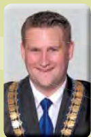
Cr. John Gangell Mayor

9279 1208 crgangell@bassendean.wa.gov.au f @GangellJohn