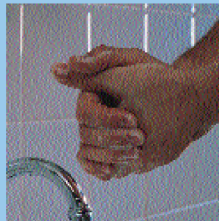
3. RUB HANDS THOROUGHLY