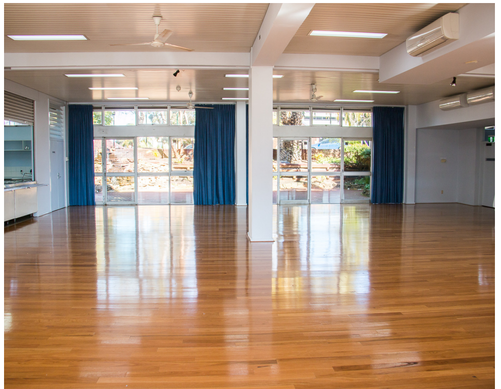
Bassendean Community Hall