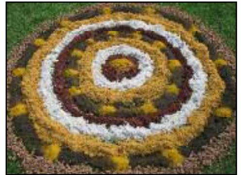
ART IN THE PARK SCULPTURE PARK EXHIBITION 2009

EPHEMERAL SCULPTURES PINATAA'S FIBRE WEAVING TATAMI COILS