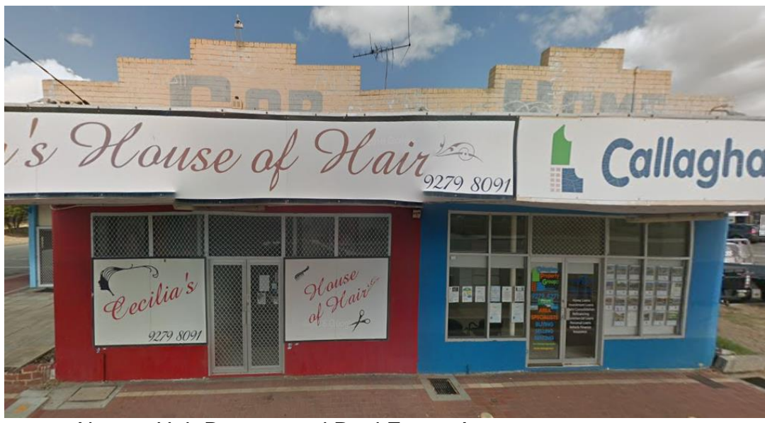
Above: Hair Dresser and Real Estate Agent

The built form outcome that is seen with the Walter Road Handy Mart is exactly the outcome that the Town is seeking to avoid, and seemingly in acknowledgement of this, the applicant states that: