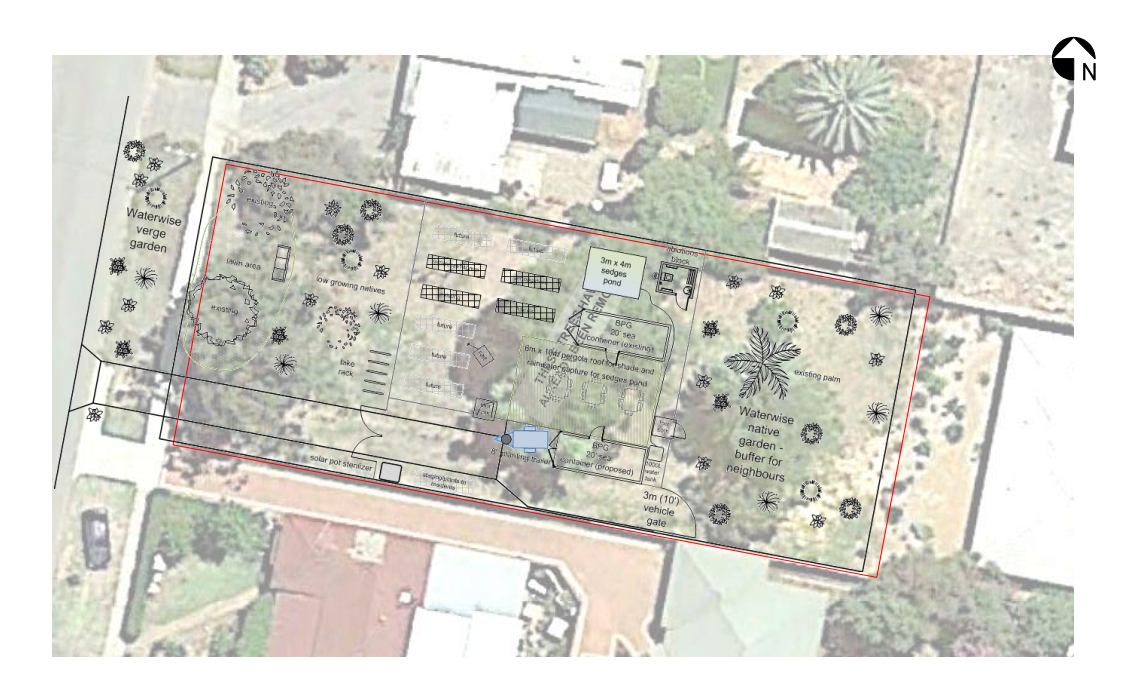
Figure 2 - Aerial Overlay - Google Earth Imagery Date: 11-Nov-15