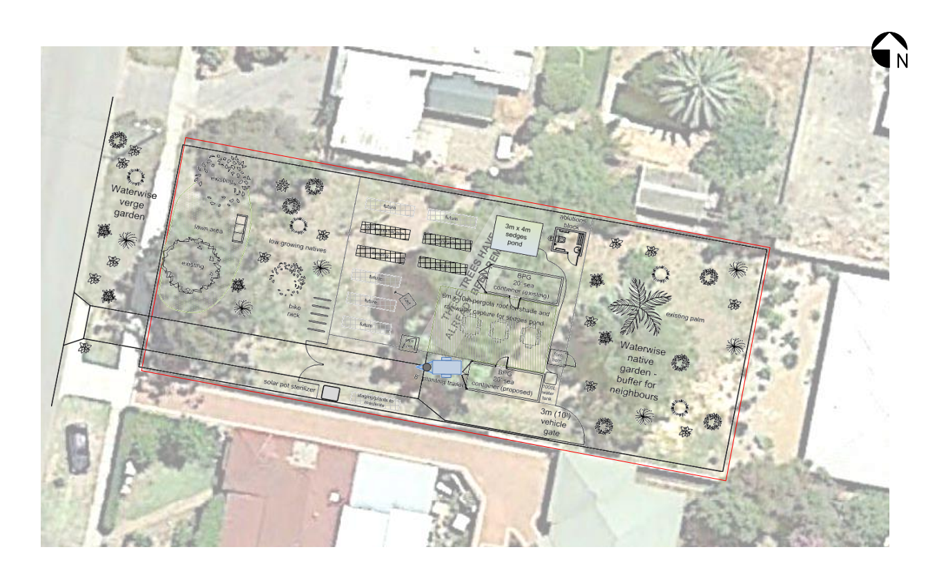
Figure 2 - Aerial Overlay - Google Earth Imagery Date: 11-Nov-15