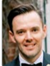
Manager Governance and Strategy