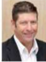
Chief Executive Officer