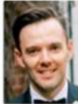
Manager Governance and Strategy