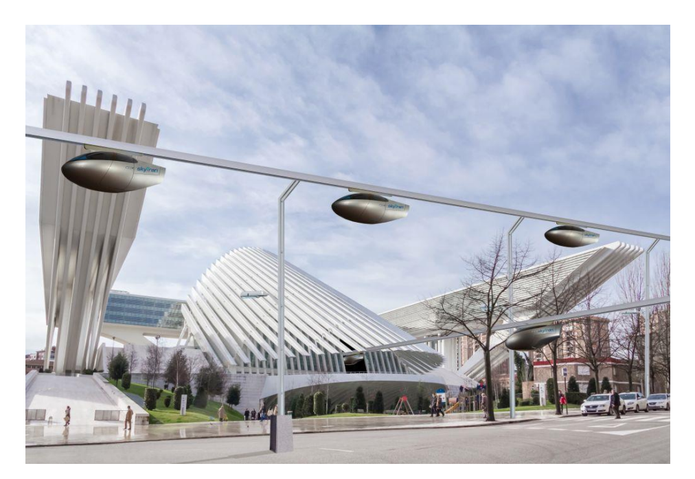
Figure 1 - Futuristic Image of the SkyTran system

Such an examination could have countenanced, for example, Israel's proposal – through a partnership with the SkyTran Company and NASA's Ames Research Centre – to develop and implement in its major metropolitan areas an on-demand mass transport system of magnetically levitating pods tethered to a gridded system of monorail tracks (see Figure 1 following).