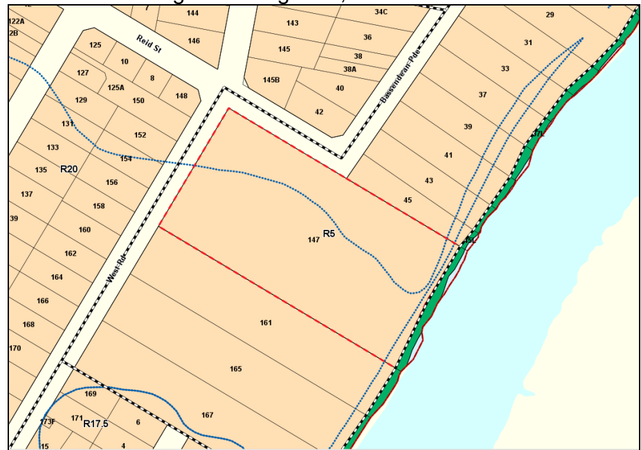
Figure 2: MRS zoning of land for the subject lot

The lot is currently zoned 'residential' under the Metropolitan Region Scheme (MRS) with a small portion of the lot that adjoins the Swan River zoned 'Parks and Recreation' as demonstrated in green in Figure 2, below.