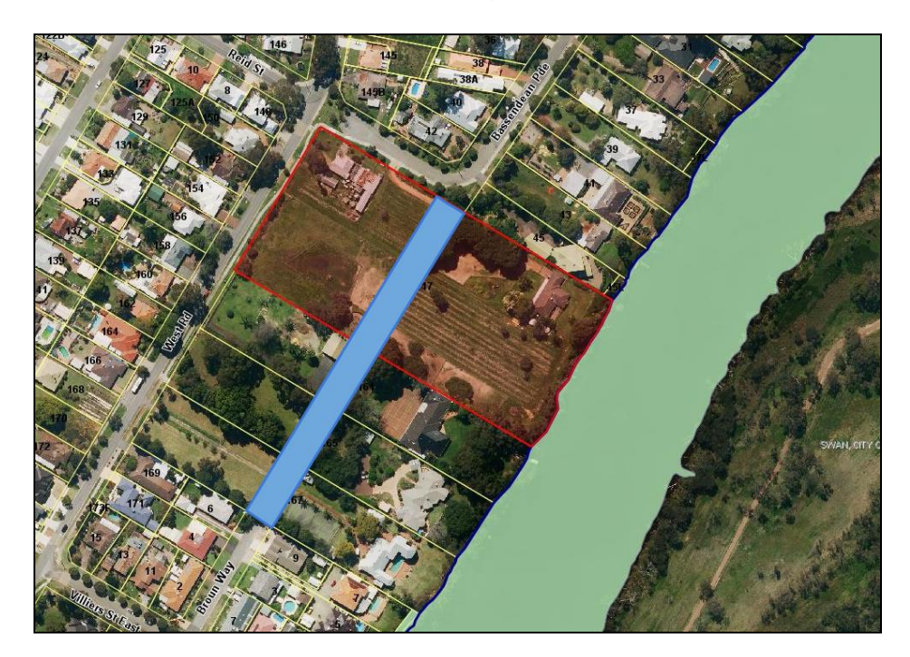
Figure 4: Future road expansion (blue hatching) required when full subdivision/development potential of southern adjoining lots is realised.

Additionally, the proposed cul-de-sac and temporary drainage reserve impede future planning. A road constructed through to the end of the southern lot boundary with a constructed temporary turn around area and associated easement within proposed lot 4 would be a more suitable arrangement considering long-term requirements. This would also address and negate lot access concerns from the proposed cul-de-sac. Figure 4 below demonstrates the subdivision/development potential of the three lots immediately to the south of the subject lot as well as the logical extension of Bassendean Parade to Broun Way (blue hatching).