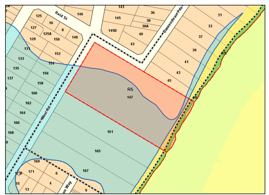
Figure 3: Extent of flood fringe & floodway within subject site.

Should the Town accept 10% of the site area for public open space purposes (see objective 10 & 11 below), as opposed to the cash in lieu component, the floodway would not fall within any proposed lots. This would be a more acceptable arrangement in that the floodway would be fully contained within public open space and therefore not restrict the development potential of the proposed lots. Figure 3 below detail the extent that the floor fringe falls within the subject site (blue hatching) and the extent that the flood way falls within the subject site (yellow hatching).