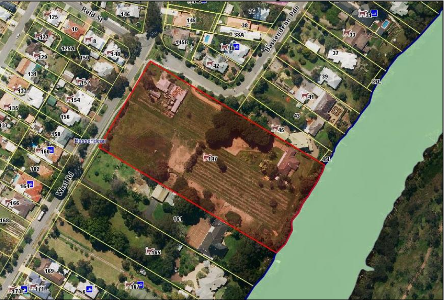
Figure 1: Proposed site for subdivision

The application is for the subdivision of Lot 336 (No. 147) West Road, Bassendean, depicted in Figure 1 below: