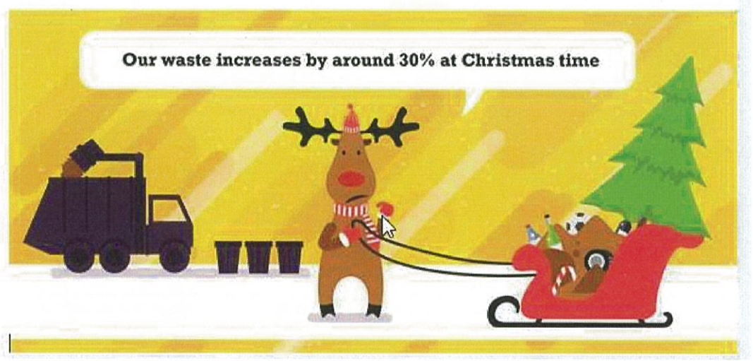
Avoid, Reduce, Reuse and Recycle

Notice is hereby given of the Ordinary Council Meeting to be held in the Council Chamber, 48 Old Perth Road, Bassendean, commencing at 7.00pm.