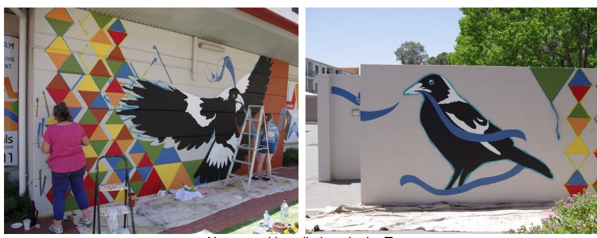
New mural installations in the Town

Notice is hereby given of the Ordinary Council Meeting to be held in the Council Chamber, 48 Old Perth Road, Bassendean, commencing at 7.00pm.