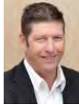
Chief Executive Officer